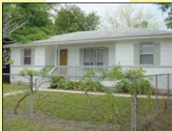
ATLANTIC BEACH 3/1 $164,000

We hope you enjoy this publication and we sure would love to hear from you!