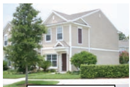
BARTRAM PK 2/2.5 $125,000 BANK OWNED SPECIAL FINANCING AVAILABLE