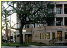
RIVERSIDE 2/2 $299K

https://www6.hsmv.state.fl.us/dlcheck/findcustomer